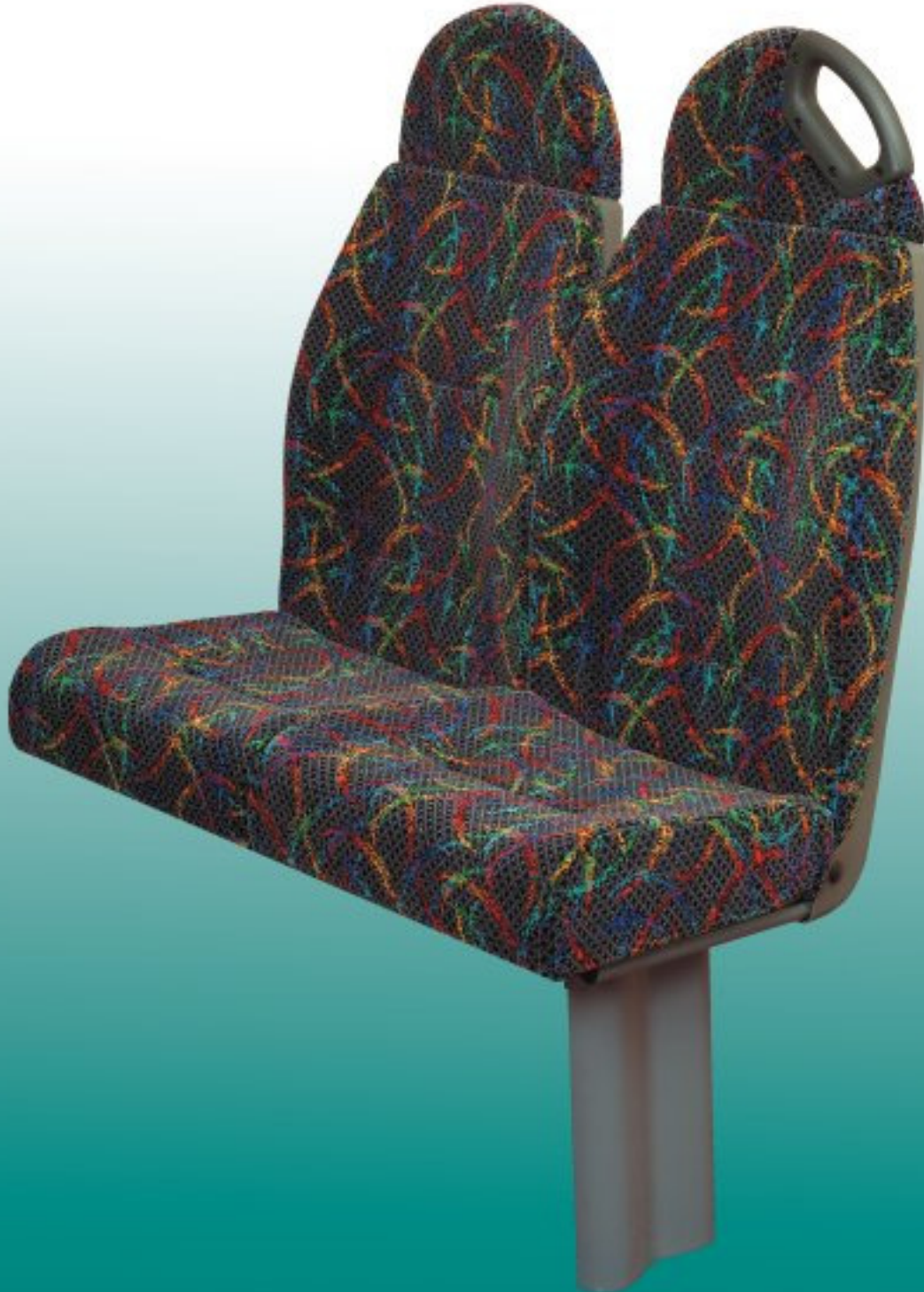
TELFORD 30 ROUND HEADREST SEAT

Manufacturers of Passenger Transport Seating